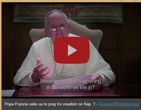
Pope Francis asks us to pray for creation on Sep. 1 - SeasonOfCreation.org

On the occasion of the sixth anniversary of Laudato Si', the Dicastery for Promoting Integral Human Development invites you to join the ecumenical family in celebrating the Season of Creation that takes place from