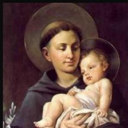
Anthony of Padua

Please consider taking time to sign up on our parish website to become a committed adorer in our Blessed Sacrament chapel. We need many adorers to assure someone is with Jesus during the hours we currently have for adoration. The more we adore the Lord, the closer we are drawn to Him and open our hearts to behold His glory, in whatever way he knows is best for us. In this life, many have testified that the closest we will get to heaven is when we are in the presence of the Eucharist. Please come and see if you too find this to be so!