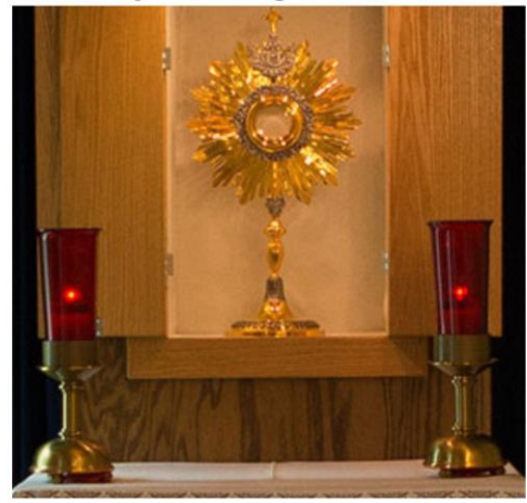
Friday, June 2, 3pm until Sunday June 4, 7am Register at

40 Hour Eucharistic Adoration Devotion For an increase in Priestly and Religious Vocations