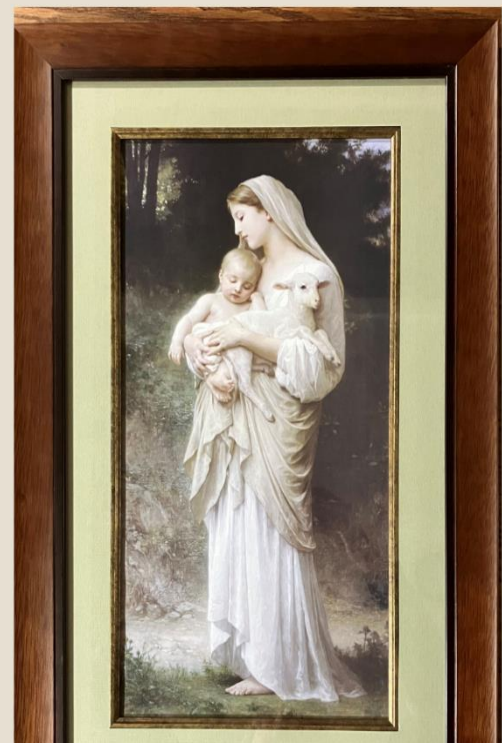
Innocence 1893 William-Adolphe Bouguereau