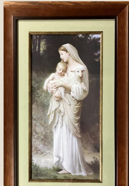
Innocence 1843 William-Adolphe Bouguereau